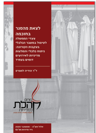
אלול תש"פ - ספטמבר 2020 נייר מדיניות מס' 62