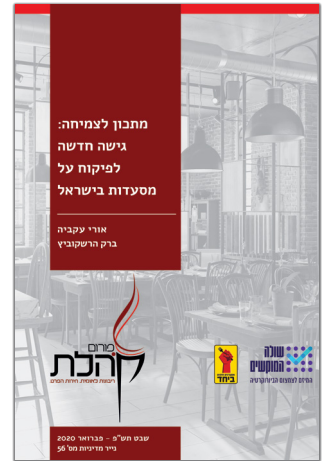
שבט תש"פ - פברואר 2020 נייר מדיניות מס' 56