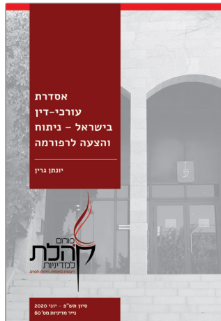
סיון תש"פ - יוני 2020 נייר מדיניות מס' 60