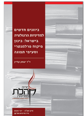
סיון תש"פ - יוני 2020 נייר מדיניות מס' 59