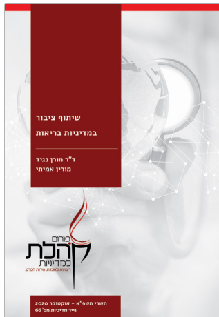
תשרי תשפ"א - אוקטובר 2020 נייר מדיניות מס' 66