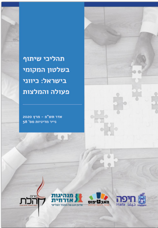
אדר תש"פ - מרץ 2020 נייר מדיניות מס' 58