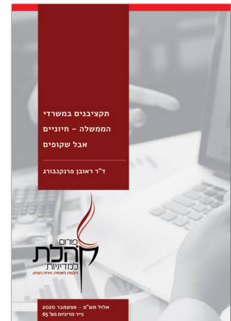
אלול תש"פ - ספטמבר 2020 נייר מדיניות מס' 65