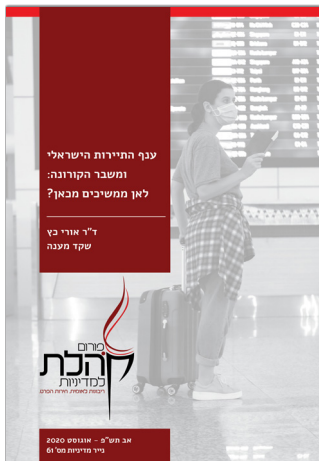
אב תש"פ - אוגוסט 2020 נייר מדיניות מס' 61