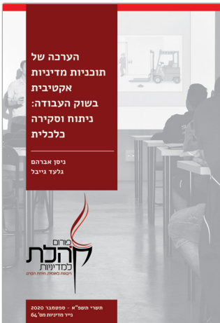
תשרי תשפ"א - ספטמבר 2020 נייר מדיניות מס' 64